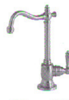
1100 Series Filtered Water Faucet