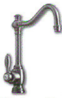
4200 Kitchen Faucet