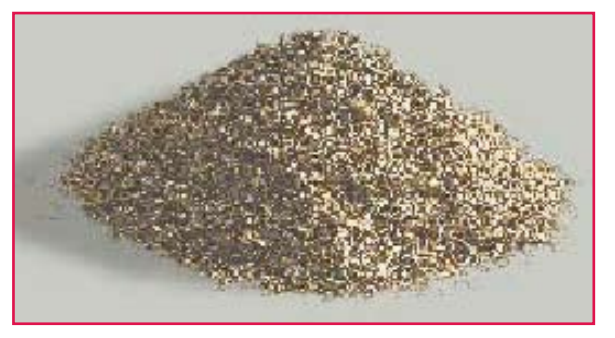
Patented KDF 55 Media